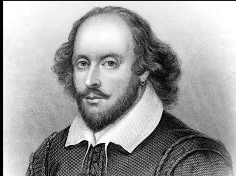
Hamlet (Act 3, Scene 4)

For 'tis the sport to have the engineer hoist with his own petard.”