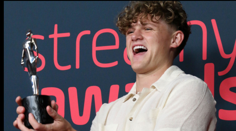
Ryan Trahan, Ryan3000, My Testimony https://www.youtube.com/watch?v=qbfsN3kINtc

“If my way wasn't working despite it working, then I gotta figure something out. Because this path is not going to yield the life that I thought I wanted”