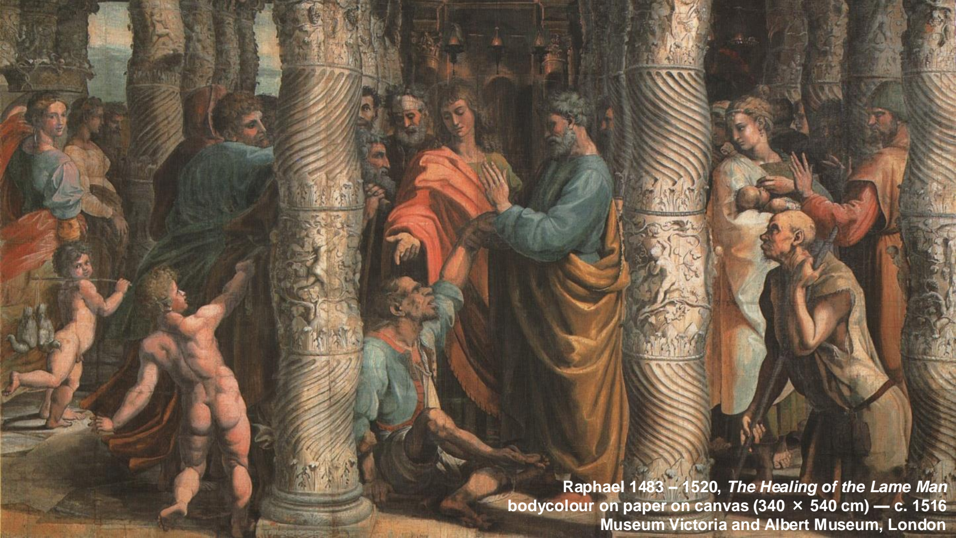
Raphael 1483 – 1520, The Healing of the Lame Man bodycolour on paper on canvas (340 × 540 cm) — c. 1516 Museum Victoria and Albert Museum, London