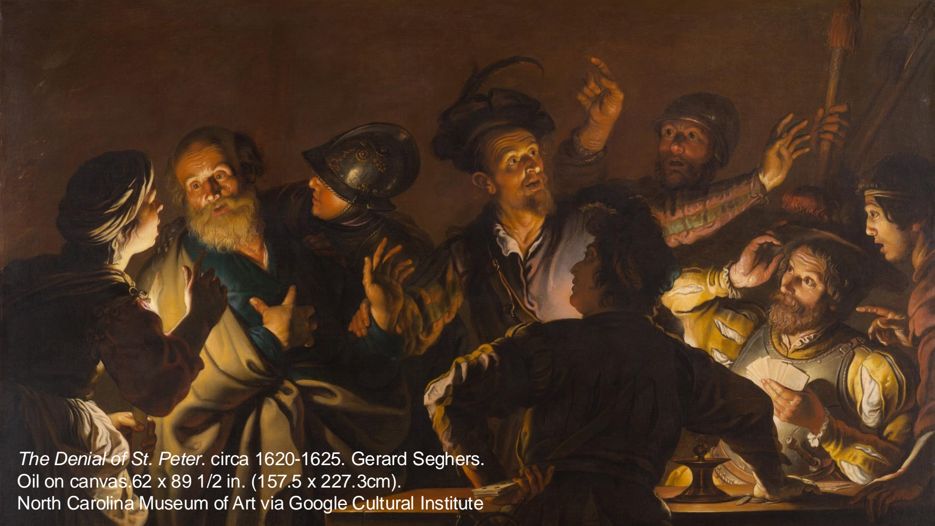
The Denial of St. Peter. circa 1620-1625. Gerard Seghers. Oil on canvas. 62 x 89 1/2 in. (157.5 x 227.3cm).