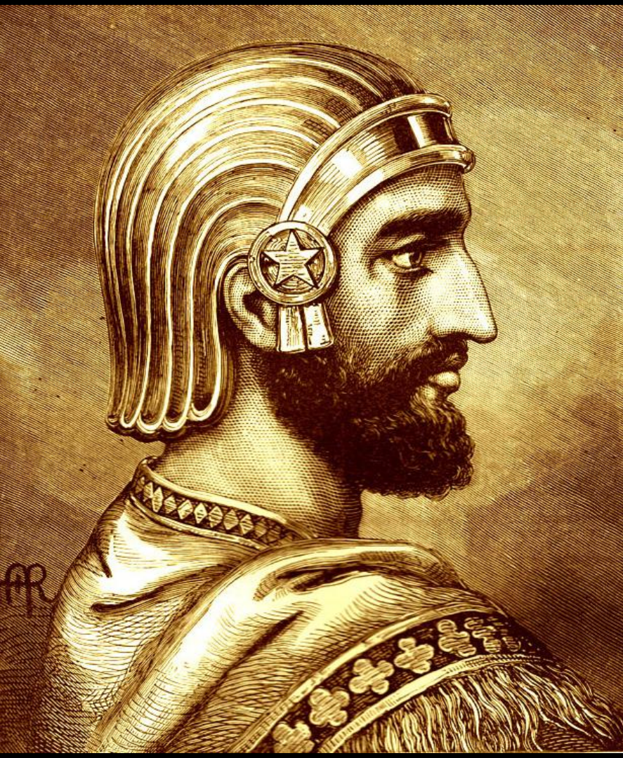
Cyrus the Great 600 – 530 B.C.