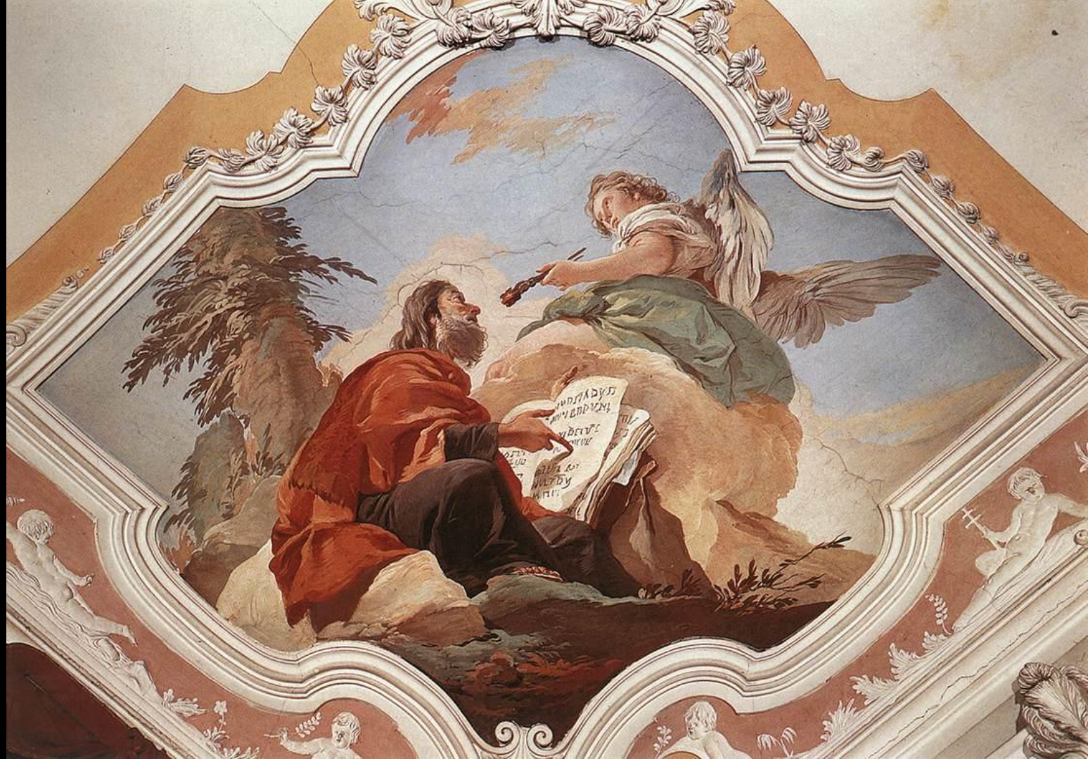
TIEPOLO, Giovanni Battista, The Prophet Isaiah 1726-29 Fresco 200 x 250 cm Palazzo Patriarcale, Udine