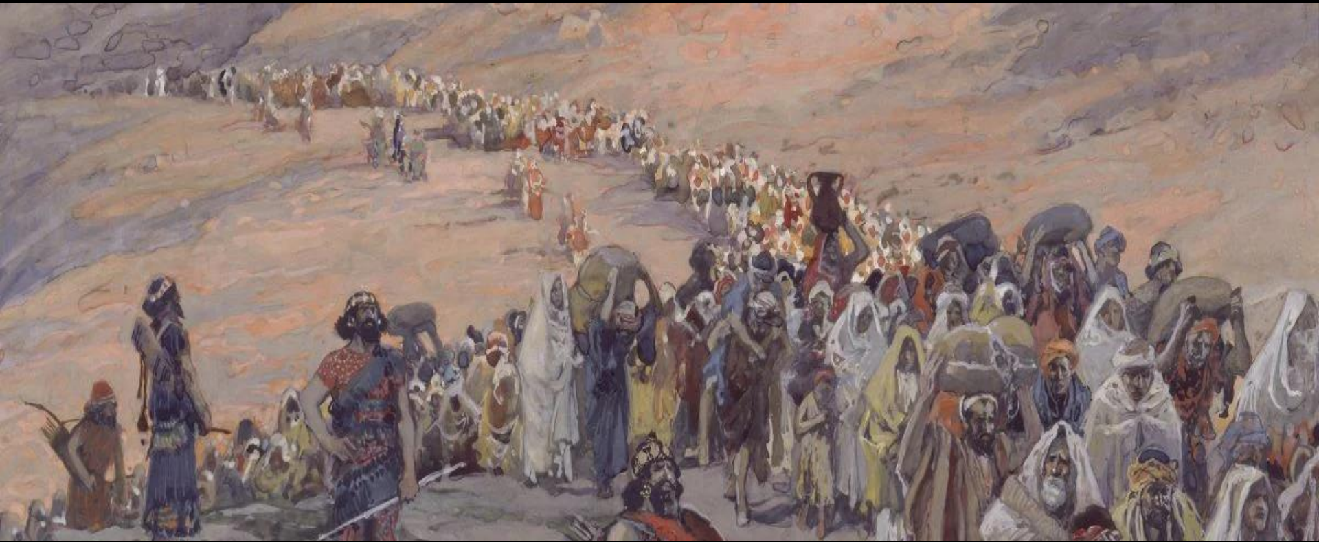
Israel going into Assyrian exile 734-715BC