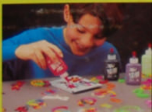
FILL THE MOLD WITH PLASTI-GOOP™

IT'S EASY TO CREATE UCKY, YUCKY, SQUIRMY, WORMY CREEPY CRAWLERS™