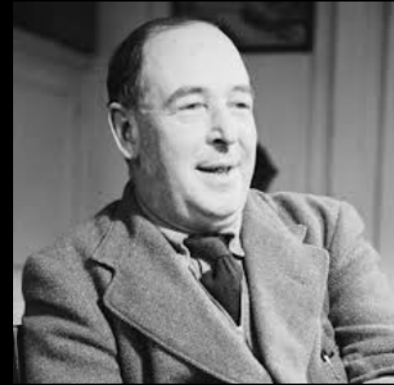
~C.S. Lewis, The Weight of Glory

“Meanwhile the cross comes before the crown and tomorrow is a Monday morning. A cleft has opened in the pitiless walls of the world, and we are invited to follow our great Captain inside. The following Him is, of course, the essential point.”