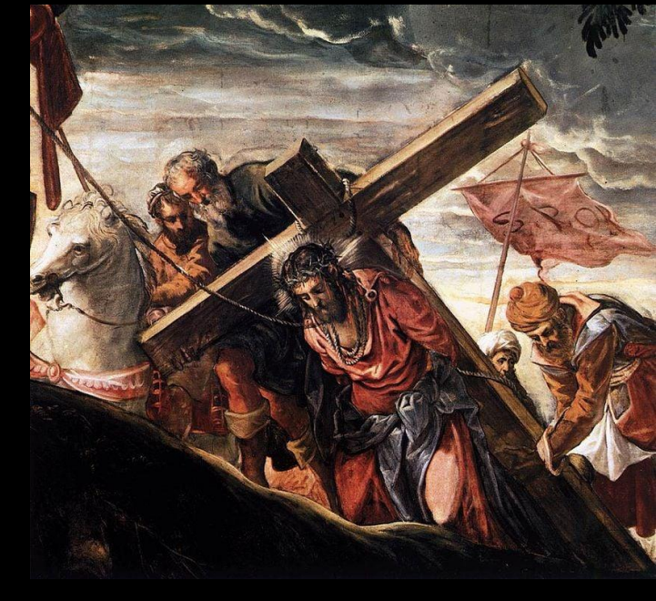
"'For God has shut up [condemned] all to disobedience in order that he might have mercy on all.' Only the disobedient and condemned receive mercy"