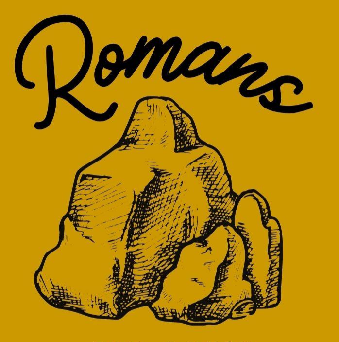
DID GOD'S PLAN FAIL?