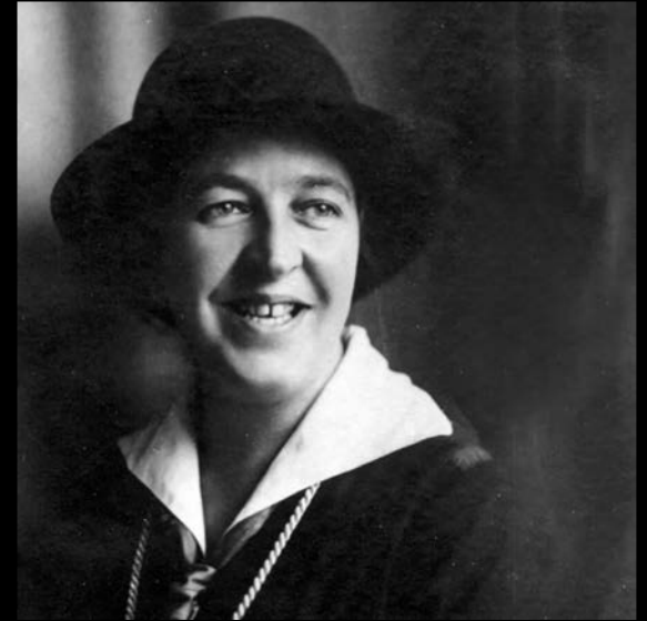
~Corrie Ten Boom

“I forgive you brother, with all my heart!”