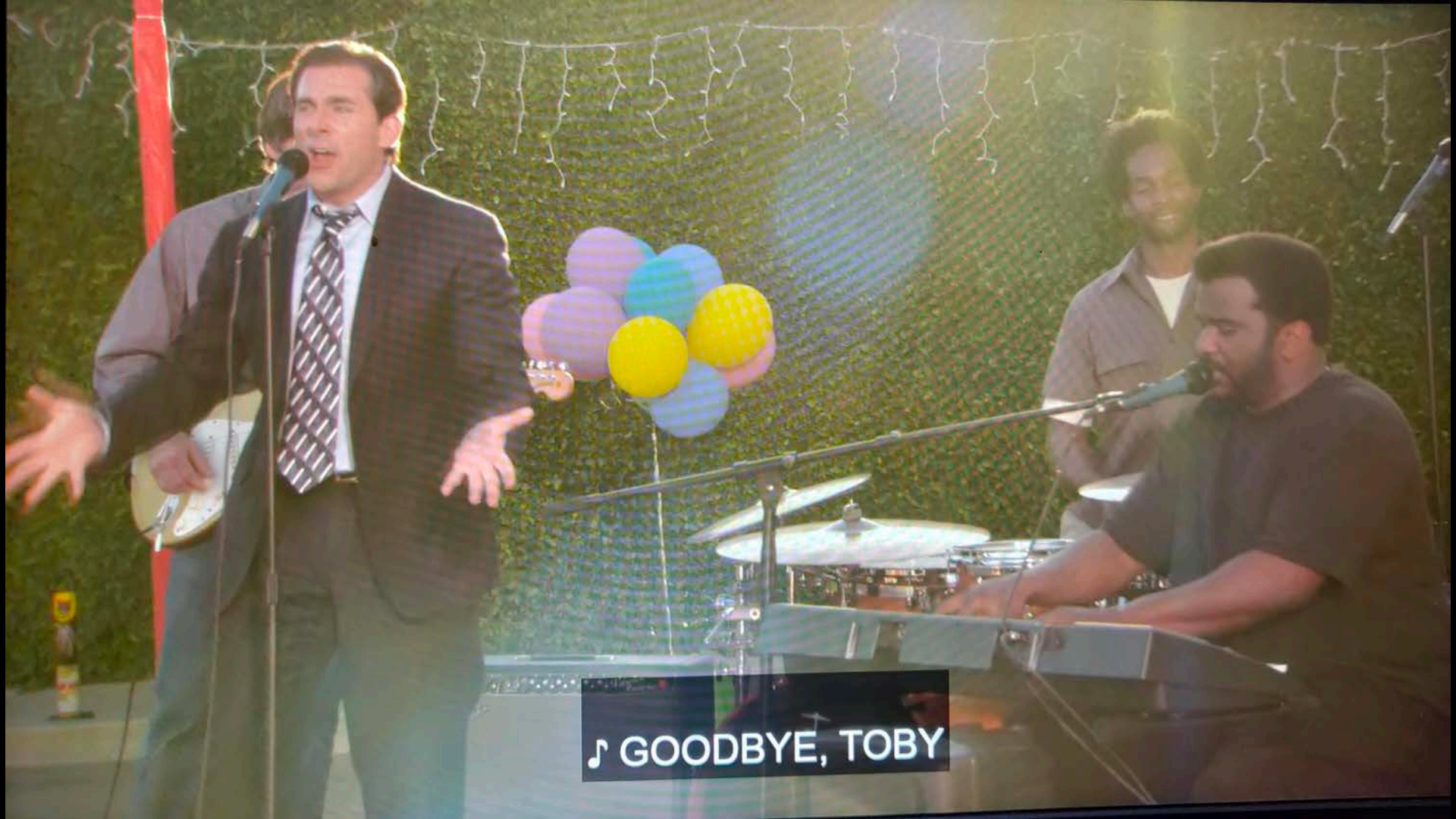
♪ GOODBYE, TOBY