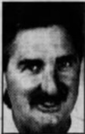
RANDY GALLOWAY The Dallas Morning News

Gosh, such a pleasant little scene. Happy days were here again at Valley Ranch. Chuckle, chuckle. Today, 0 and 5, or actually, 0 and awful. Tomorrow, the Super Bowl