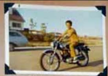
1978 Holiday - 1st year