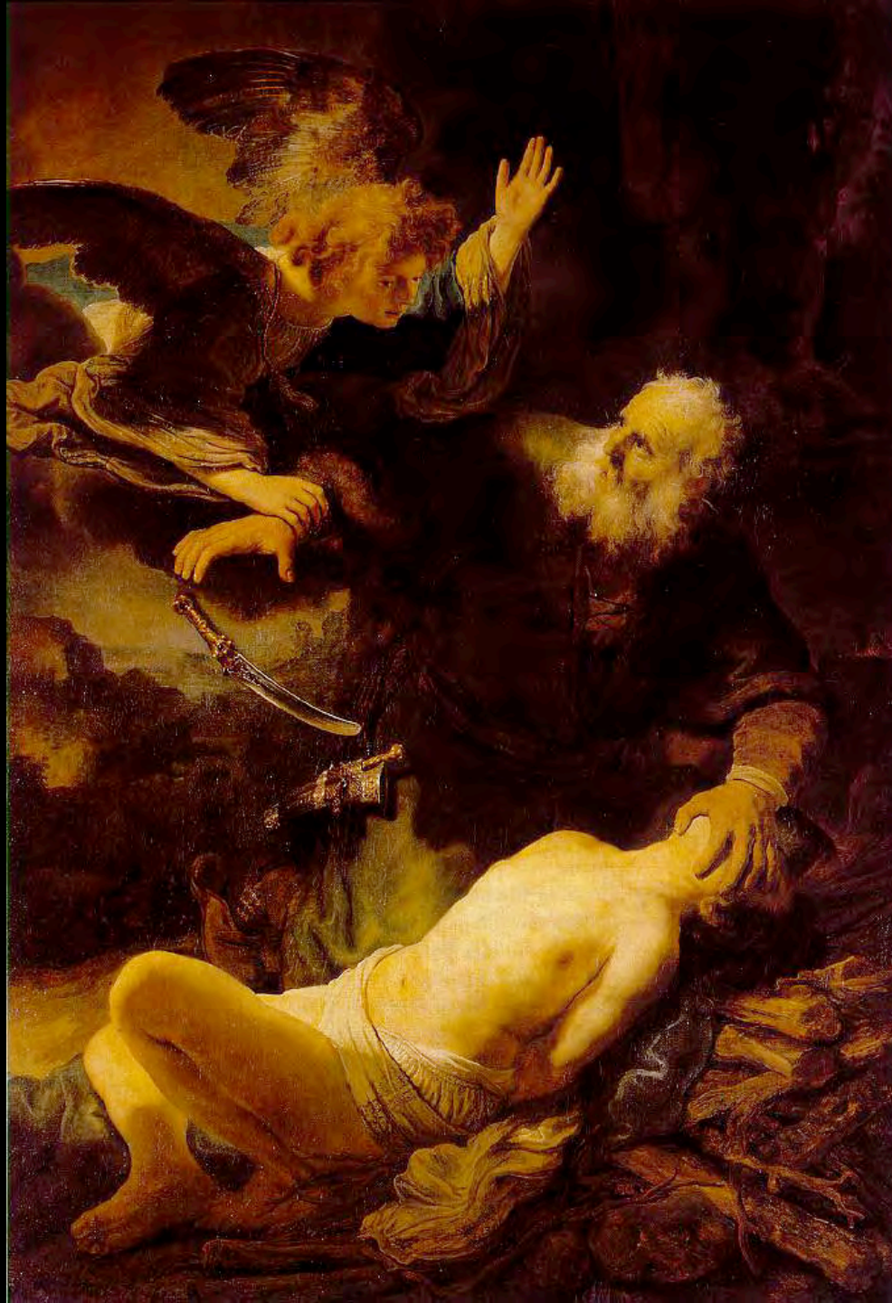
Abraham and Isaac Rembrandt, 1630