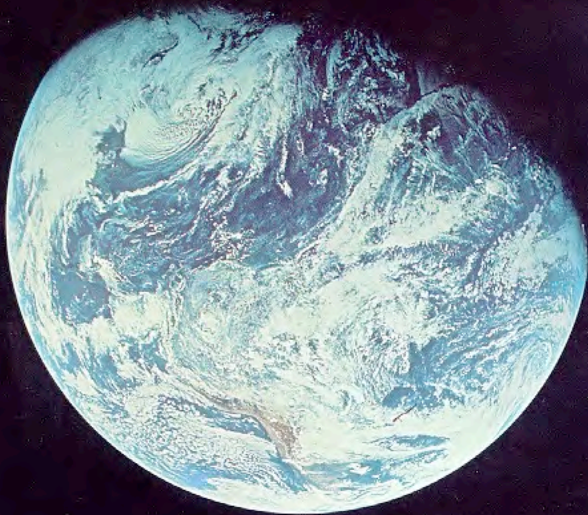
Taken from Apollo 8, 1968