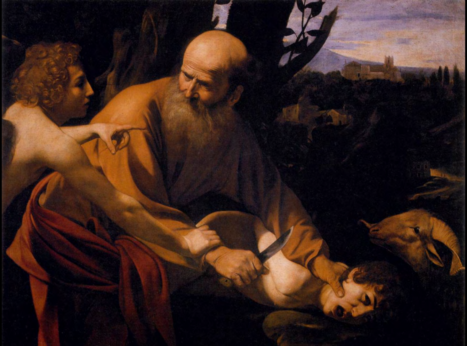
CARAVAGGIO , The Sacrifice of Isaac , 1601-02, Oil on canvas, 104 x 135 cm, Galleria degli Uffizi, Florence