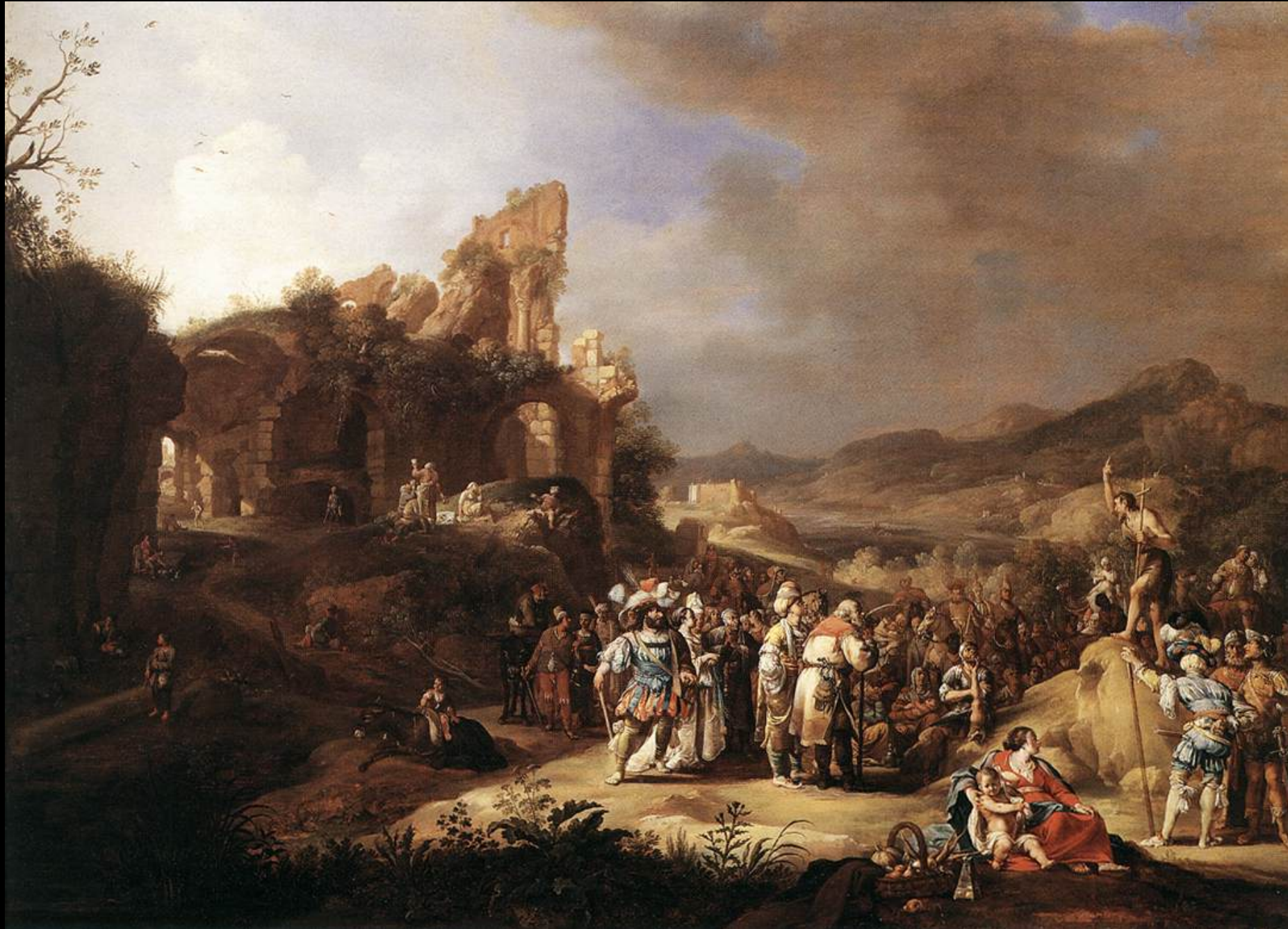
BREENBERGH, Bartholomeus (b. 1598/1600, Deventer, d. 1657, Amsterdam)