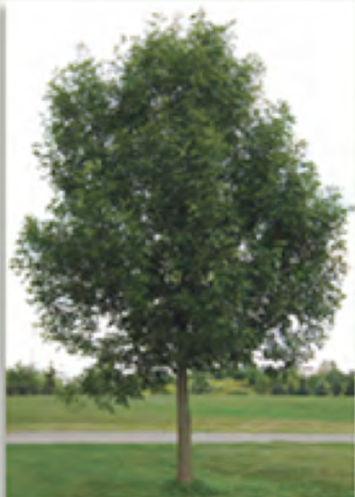
HEALTHY ASH TREE