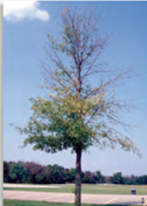
INFESTED ASH TREE