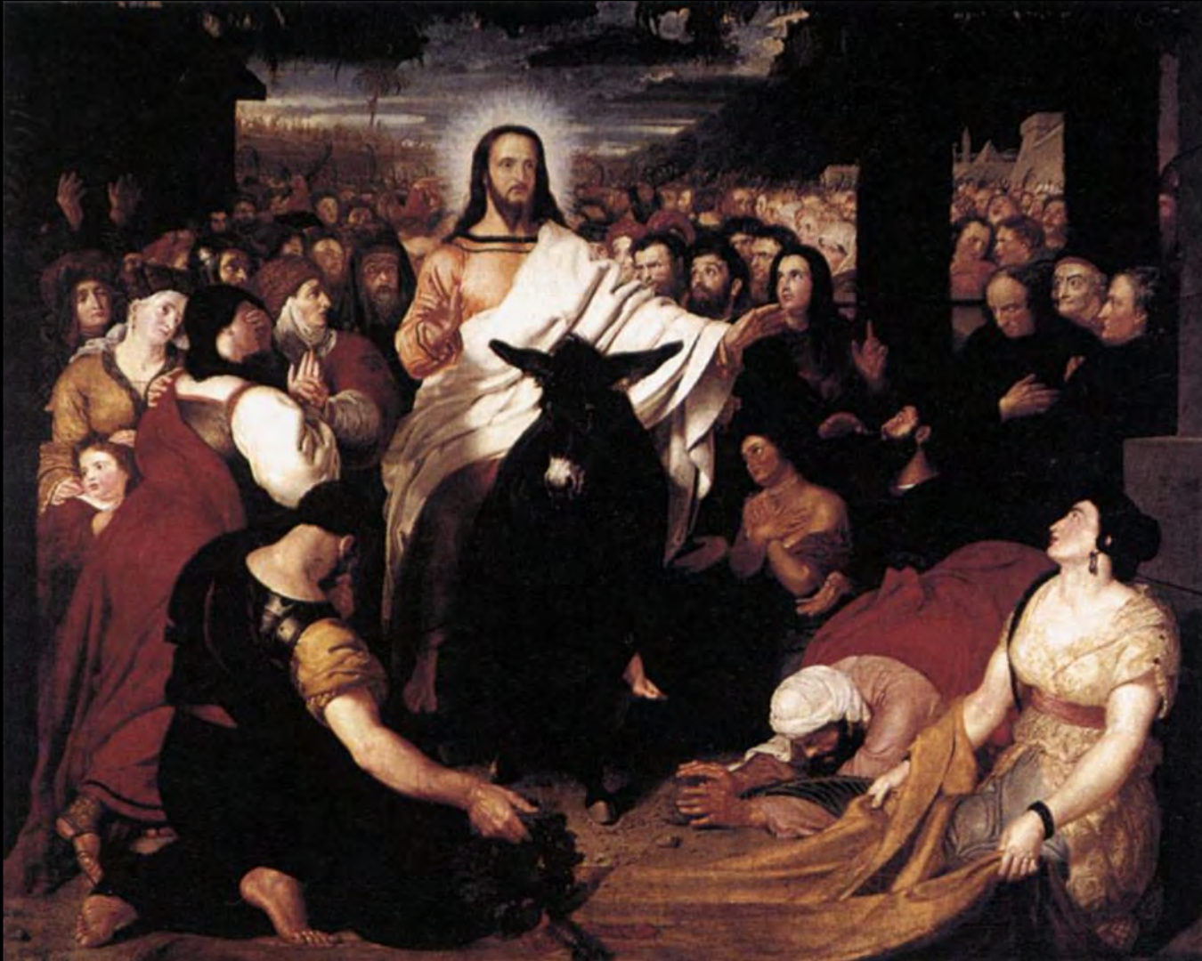
HAYDON, Benjamin Robert Christ's Entry into Jerusalem 1814-20 Oil on canvas, 396 x 457 cm, Mount St Mary's Seminary, Cincinnati