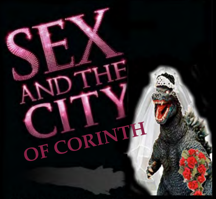
ORIGINAL MOTION PICTURE SOUNDTRACK