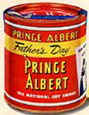
PRINCE ALBERT Smoking Tobacco