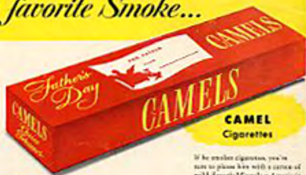
CAMEL Cigarettes If he smokes cigarettes, you're sure to please him with a carton of wild, beautiful Camels - America's favorite cigarettes!