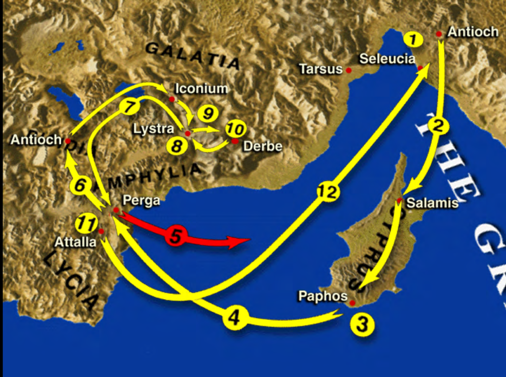
Paul's First Church Planting Journey - Acts 13:1-14:28 (c. AD 46-48)