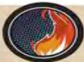
Hail and Fire Exodus 9:13-35