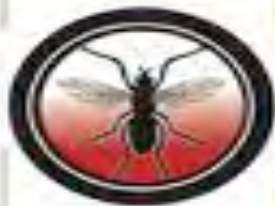
Gnats (Lice) Exodus 8:12-15