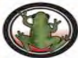
Amphibians (Frogs) Exodus 7:25-8:11