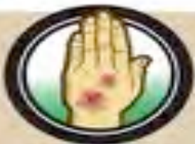
Unhealable Sores Exodus 9:8-12