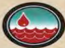
Waters Turn to Blood Exodus 7:14-25