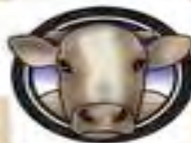
Disease on Livestock Exodus 9:1-7