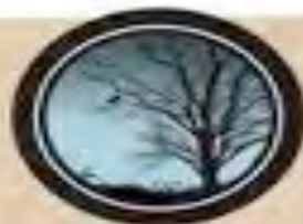
Darkness Exodus 10:21-29