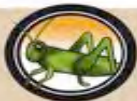
Locusts Exodus 10:1-20