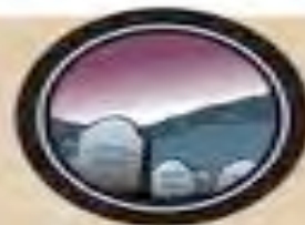
Death of First-Born Exodus 11:1-12:36