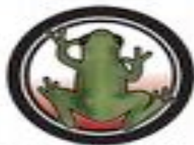
Amphibians (Frogs) Exodus 7:25-8:11