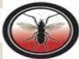
Gnats (Lice) Exodus 8:12-15