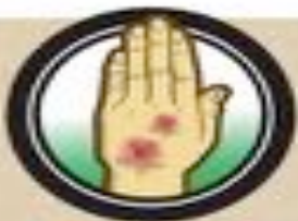
Unhealable Sores Exodus 9:8-12