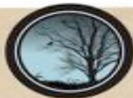
Darkness Exodus 10:21-29