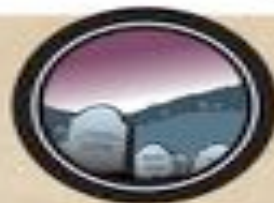
Death of First-Born Exodus 11:1-12:36