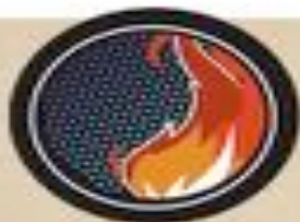
Hail and Fire Exodus 9:13-35