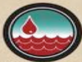
Waters Turn to Blood Exodus 7:14-25