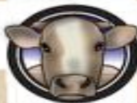
Disease on Livestock Exodus 9:1-7