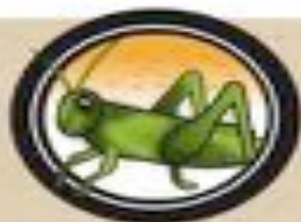
Locusts Exodus 10:1-20