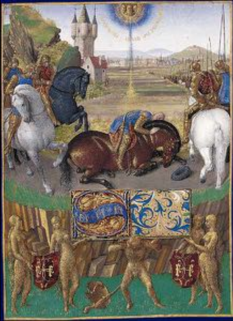
Jean Fouquet, Saint Paul , circa 1452-1460 illumination on parchment, 16.5 × 12 cm Condé Museum