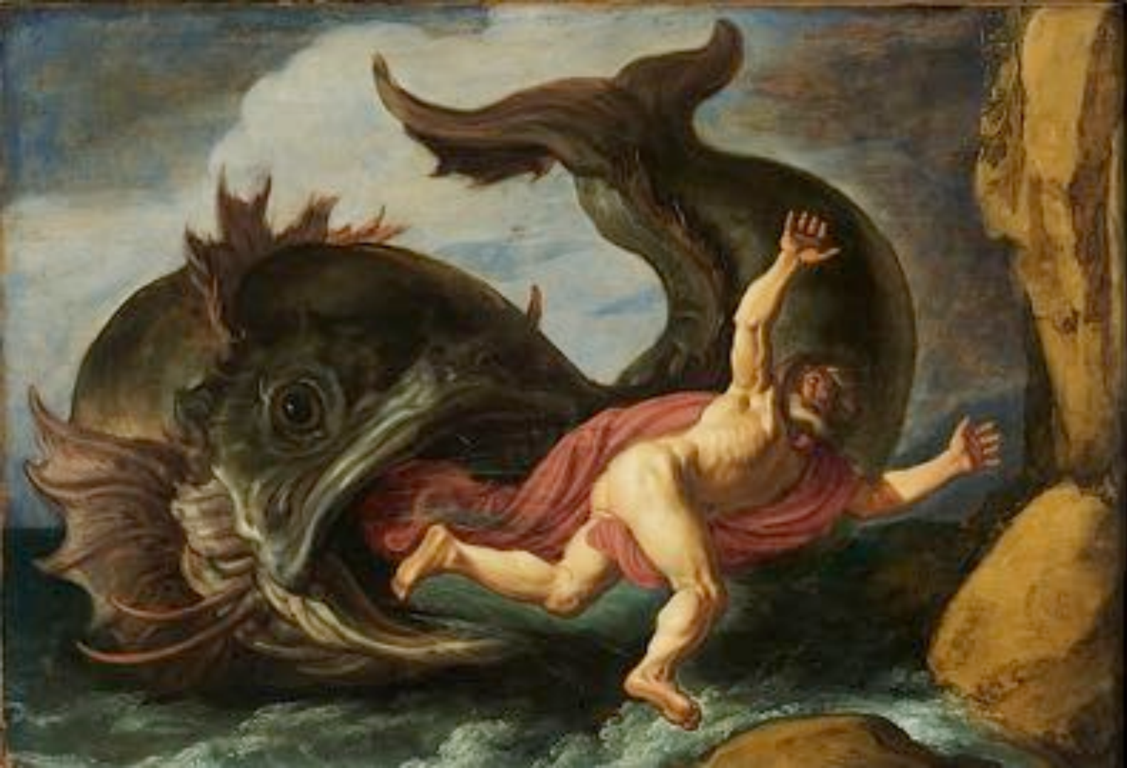
Pieter Lastman, Jonah and the Whale, 1621, Oil on oak, 360 mm by 521 mm, Museum Kunstpalast