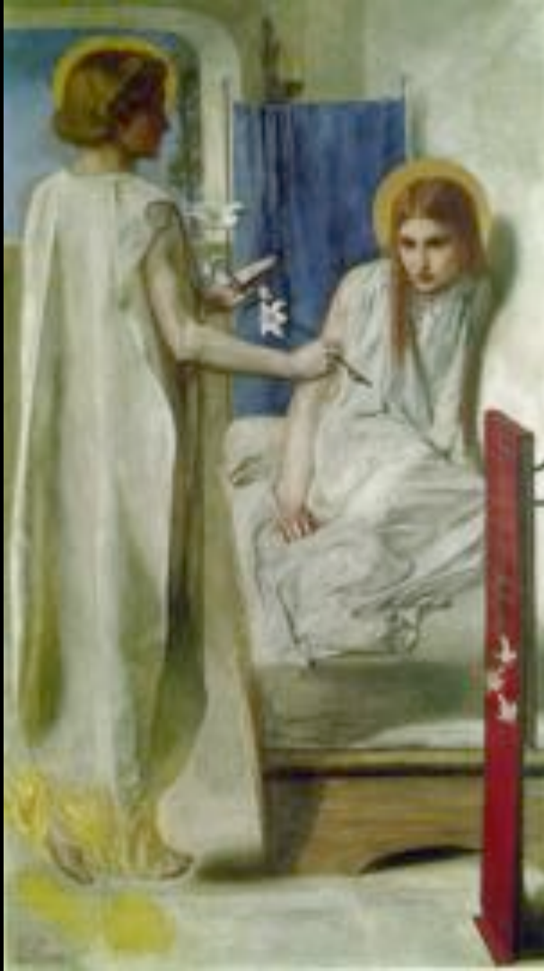
Rossetti, Dante Gabriel Ecce Ancilla Domini! ( The Annunciation ) 1849-50, Oil on canvas, 28 1/8 x 16 1/2 in, Tate Gallery, London