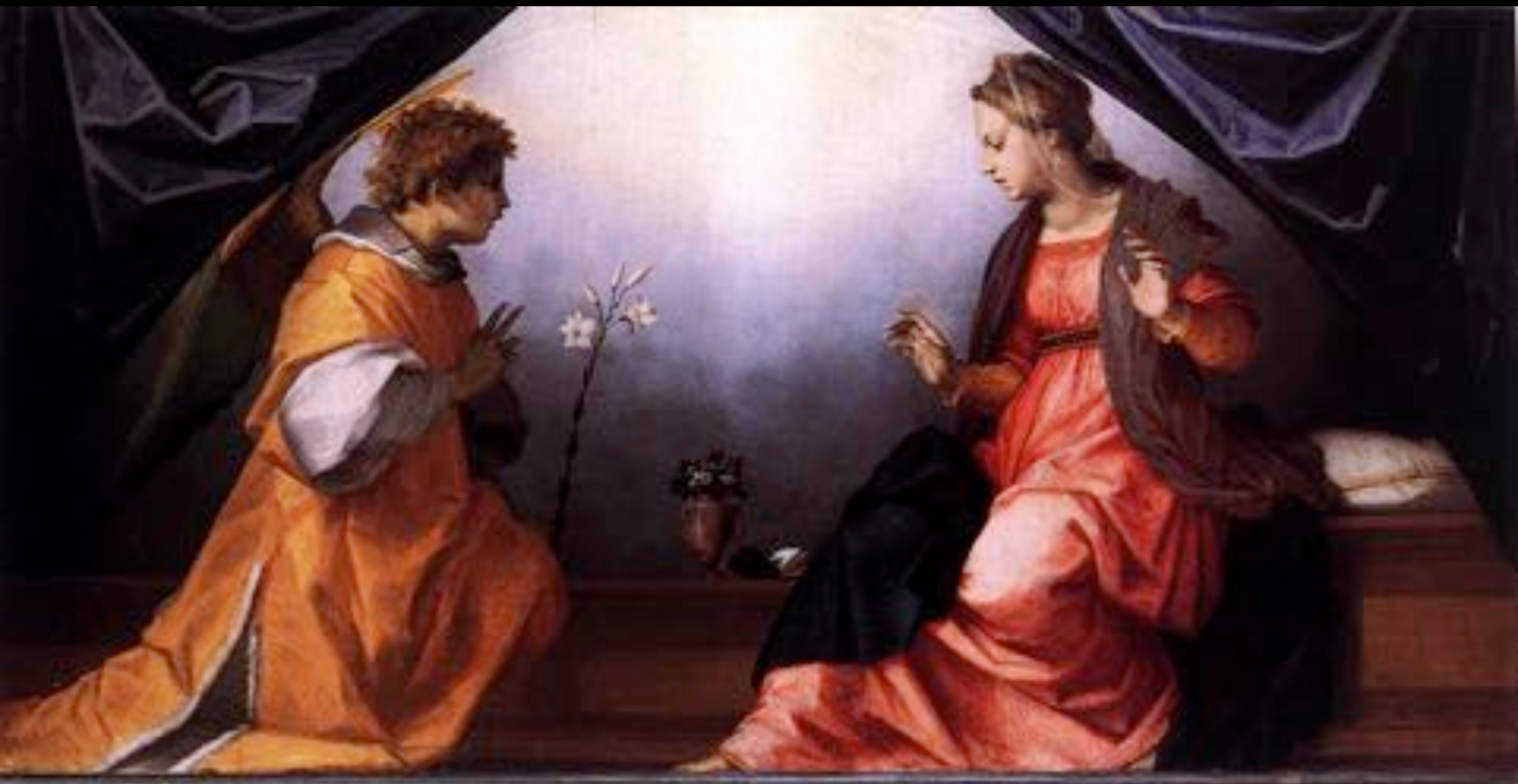
ANDREA DEL SARTO – Annunciation c. 1528, Oil on wood, 96 x 189 cm, Galleria Palatina (Palazzo Pitti), Florence