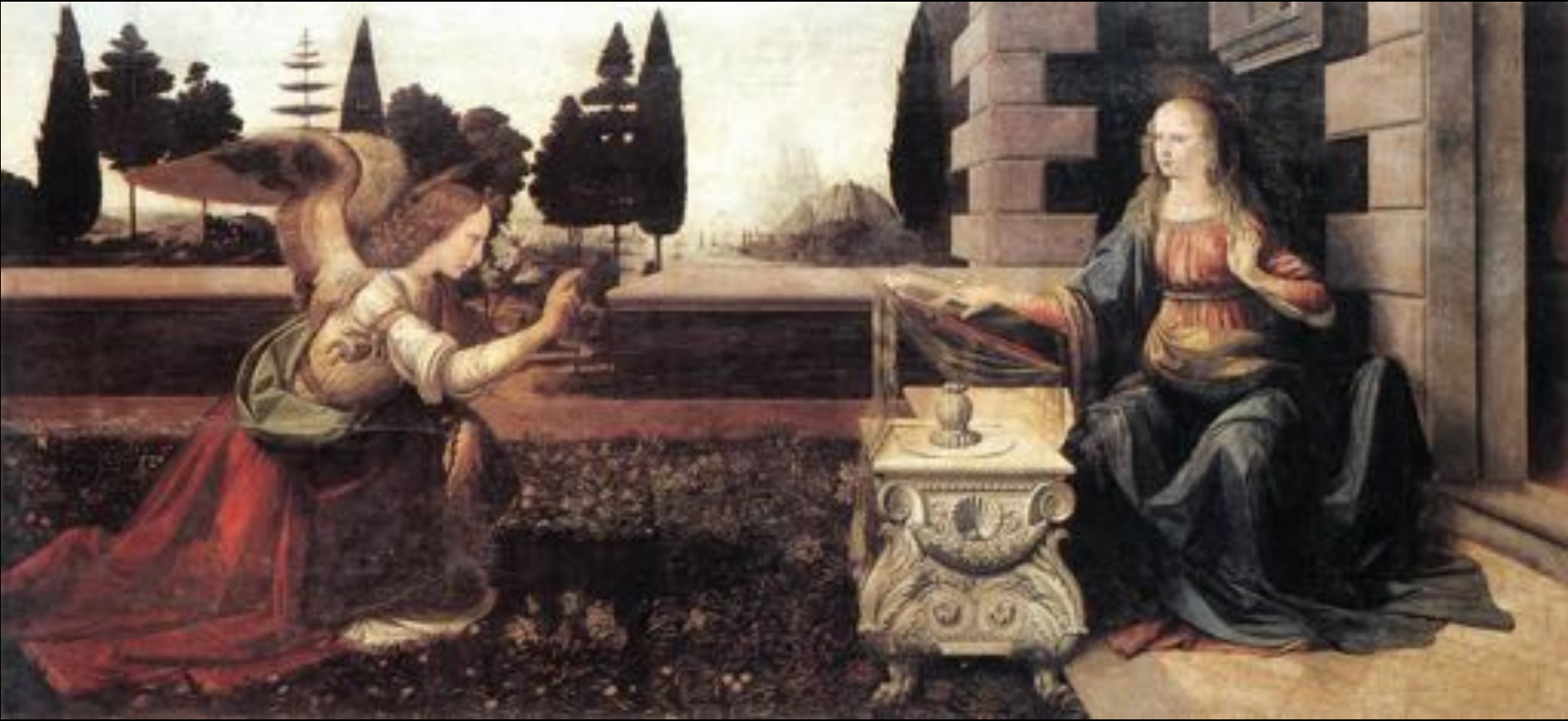
Leonardo da Vinci - The Annunciation (1472-1475) Oil and Tempera on wood, 78 x 219 cm Florence Uffizi