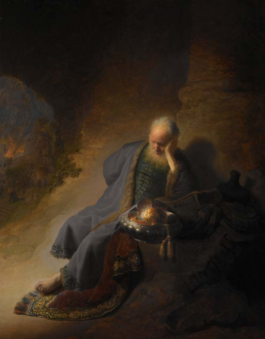
REMBRANDT Harmenszoon van Rijn Jeremiah Lamenting the Destruction of Jerusalem , 1630 Oil on panel, 58 x 46 cm Rijksmuseum, Amsterdam