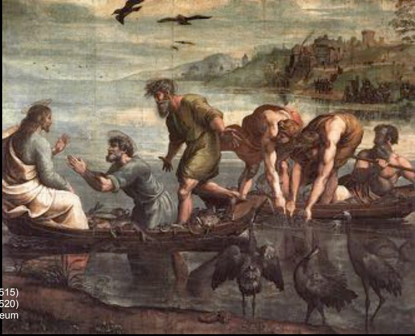
The Miraculous Draught of Fishes (1515) Raphael (1483–1520) Victoria and Albert Museum