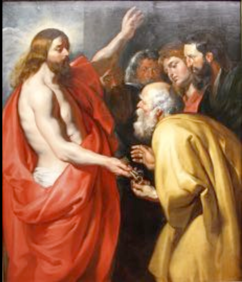
Christ Giving the Keys to St. Peter (1612) Peter Paul Rubens (1577–1640) 182.6 cm x 159 cm Gemäldegalerie, Berlin