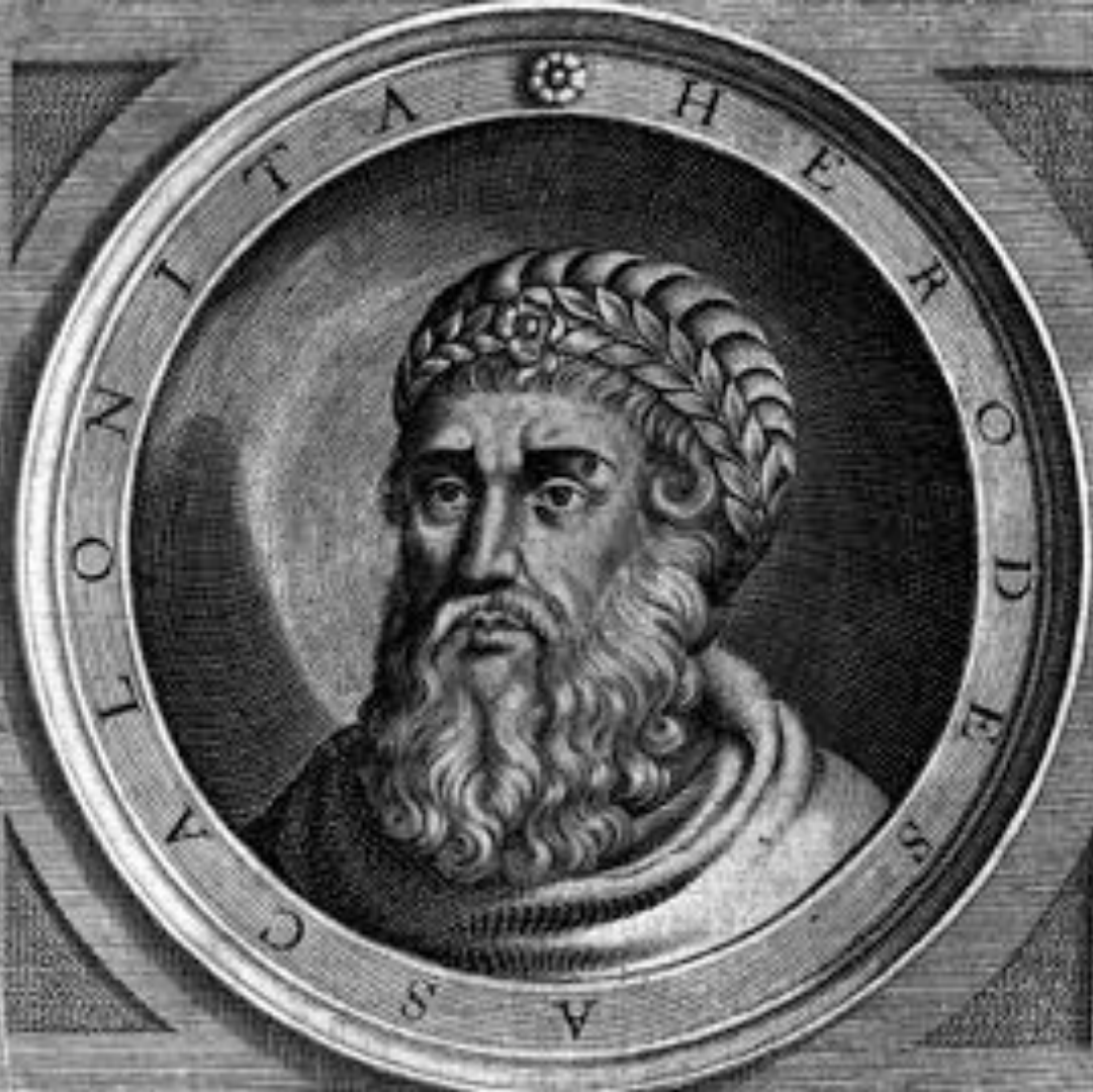
Person #1 Herod the Great