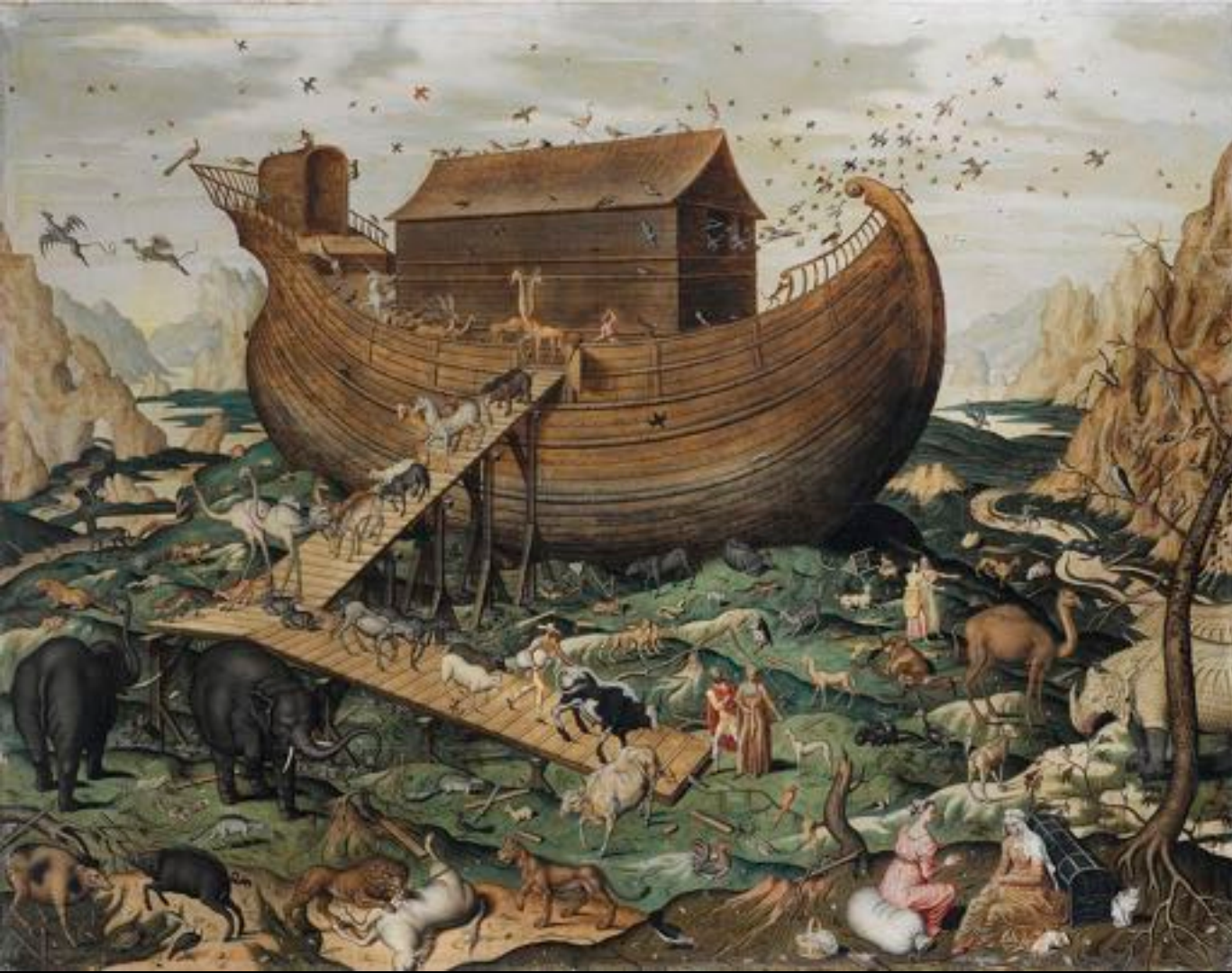
Simon de Myle Noah's ark on the Mount Ararat 1570, oil on panel 114 × 142 cm Collection privée du sud-ouest de la France