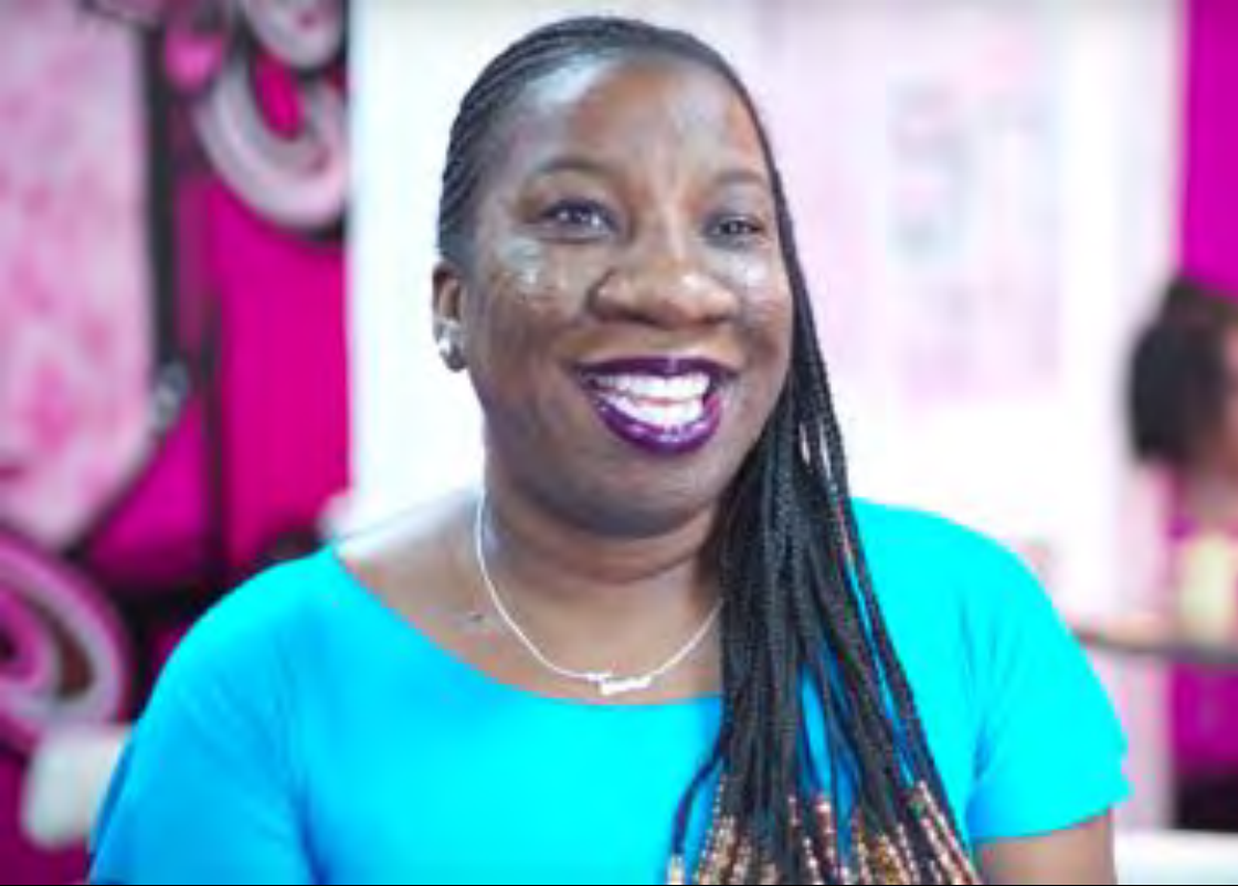
Tarana Burke, public speaker and community organizer based in New York