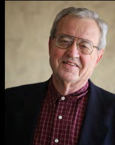
Dallas Willard, Renovation of the Heart

“Actions are not impositions on who we are, but are expressions of who we are. They come out of a heart and the inner realities it supervises and interacts with.”