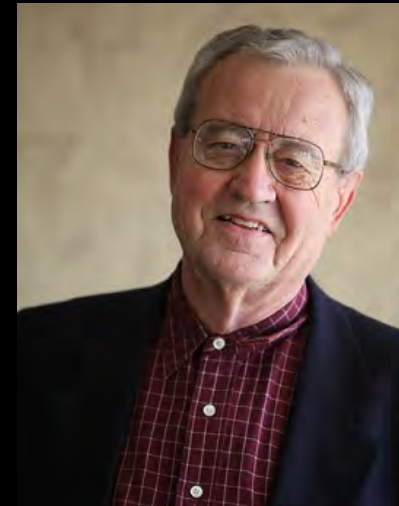
Dallas Willard, Renovation of the Heart

Accordingly, the greatest need you and I have – the greatest need of collective humanity – is renovation of our heart. That spiritual place within us from which outlook, choices, and actions come has been formed by a world away from God. Now it must be transformed.