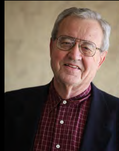
Dallas Willard, Renovation of the Heart

We live from our heart...Our life and how we find the world now and in the future is, almost totally, a simple result of what we have become in the depths of our being – in our spirit, will, or heart....We live from our depths – most of which we do not understand.